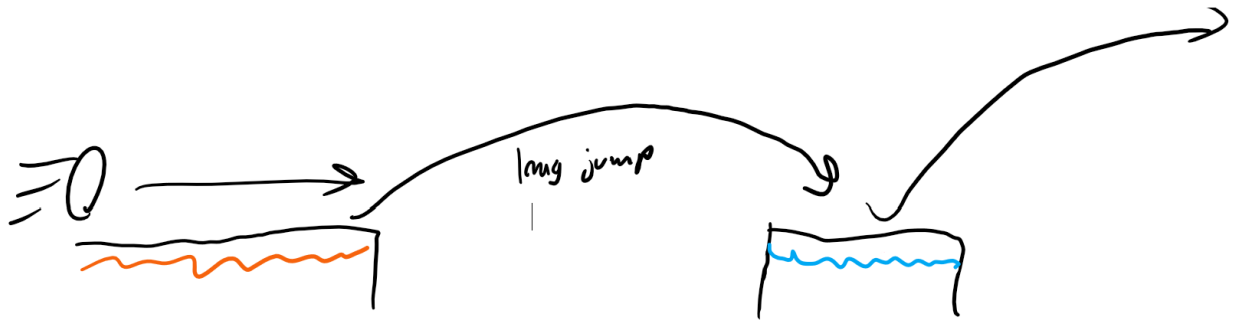
This picture details a use case for speed paint (orange, left) that is used to allow the player to jump a long distance onto a bouncy surface (blue, right) as means of completing a puzzle.

The player starts a level with a limited amount of paint. By constraining the amount of paint they player has we force them to be strategic in the use of their paint. They cannot simply paint all of the surfaces (the brute force method), they must think carefully and try multiple things to solve the puzzles. There will be two ways for the player to refill their paint supply. One is a paint pool, which is a vat of a single color of